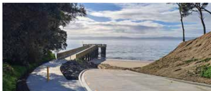
Photo: Pouto Wharf

To minimise the cost to ratepayers, we look for alternative funding sources, such as government grants, wherever possible. Projects like Pouto Wharf, Pahi toilets, the new floodgate at Canal G in Te Kowhai, stormwater improvements for Robert Street in Mangawhai and cleaning the Awakino River mouth are all supported by central government funding. The emergency road repairs we are completing this year as a result of extreme weather events will be supported by a higher NZ Transport Agency subsidy.